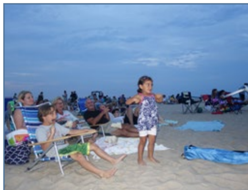
Everyone had so much fun, especially this little girl singing and dancing along with the Disney Sing-Along pre-flick event on Tuesday, July 26, 2016.