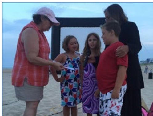
These brave souls stole the show during the Disney Sing-Along pre-flick event on Tuesday, July 26, 2016 prior to the feature film, Disney's Inside Out.