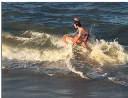
On Tuesday, July 12, 2016, Associate Sponsor, Relyance Skim Camp, hosted a mini-skim camp during the pre-flick event at Fenwick Flicks. This skim all-star was enjoying the waves before the Minions movie on the beach.