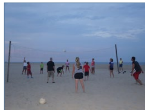
Family and friends enjoying a game of volleyball on the beach at sunset as they await the start of Fenwick Flicks the Minions movie on Tuesday, July 12, 2016.