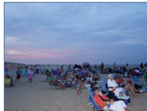
Fenwick Flicks hosted a beautiful sunset and a great crowd for Disney's Inside Out movie on the beach on Tuesday, July 26, 2016. Join us on August 9, for Fenwick Flicks featuring Toy Story 3.